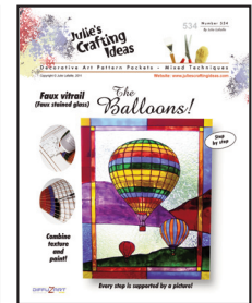
Number 534 Vitrail - Balloons