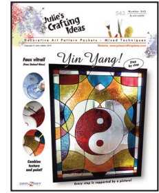
Number 543 Yin Yang!