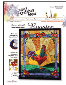
Number 514 Vitrail - Rooster