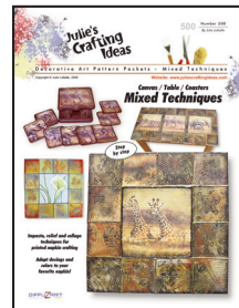
Number 500 Mixed Techniques