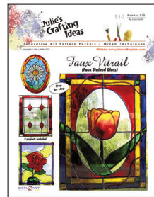
Number 510 Faux vitrail