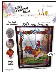
Number 540 At Cockrow