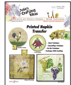
Number 508 Printed Napkin Transfert

*Other publications offered in French. Translation available upon request