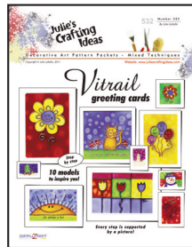
Number 532 Vitrail greeting cards