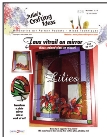
Number 528 Vitrail on mirror