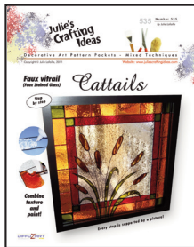
Number 535 Vitrail - Cattails