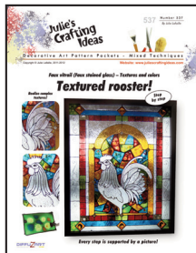
Number 537 Textured rooster