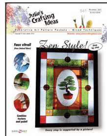
Number 541 Zen Style!